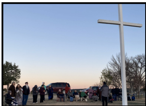
Left: Easter Sunrise Service at Greenwood Cemetery Below: Easter Breakfast enjoyed by many in the Fellowship Hall following the Easter Sunrise Service