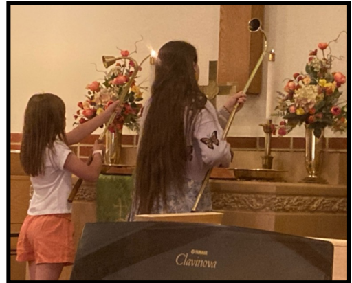
Youth serve as acolytes during the church service.